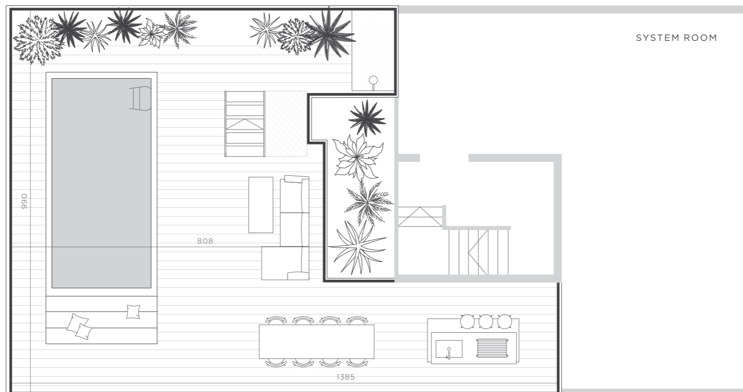
FLAT 12 Penthouse Roof Top 107 m 2